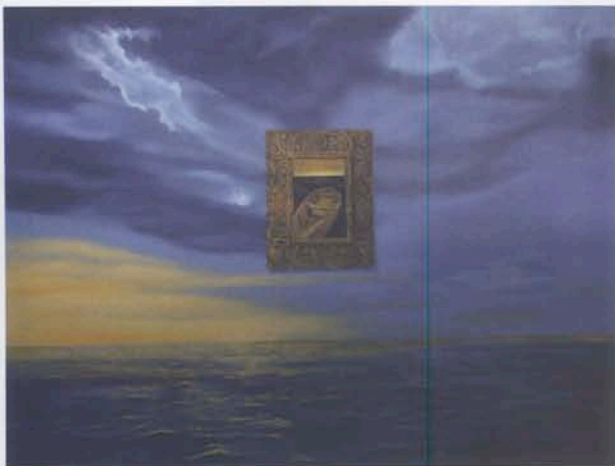
Raúl Villarreal, Ambos Mundos , oil on linen, 36" x 48".

For a category doubly threatened with marginalization, it is refreshing to see that female/Latina artists are well represented in “We Are You,” comprising over one-third of the exhibiting artists.