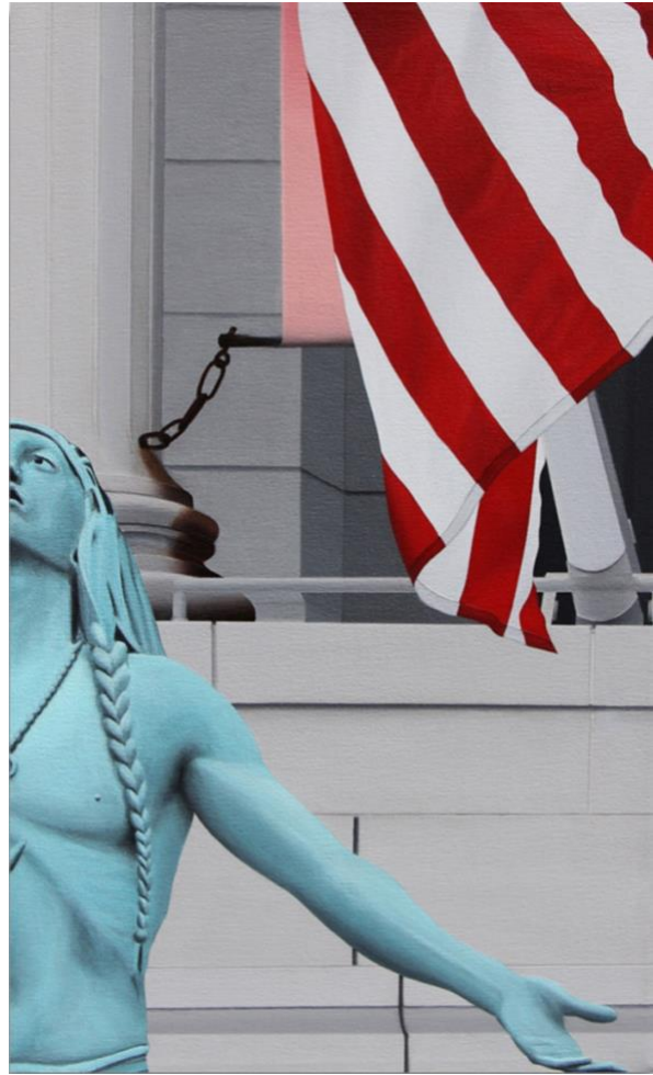
[L] Alayna Coverly, "Displaced", oil