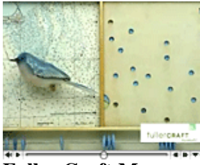
Fuller Craft Museum

Enter the March/April 2012 centerfold contest!