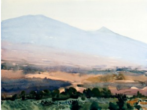
Foothills of Monte Amiata Watercolor 12x16